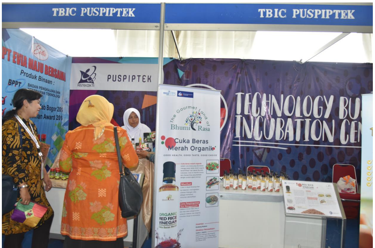
The Innovation Exhibition during ASEAN India Grassroots Innovation Forum