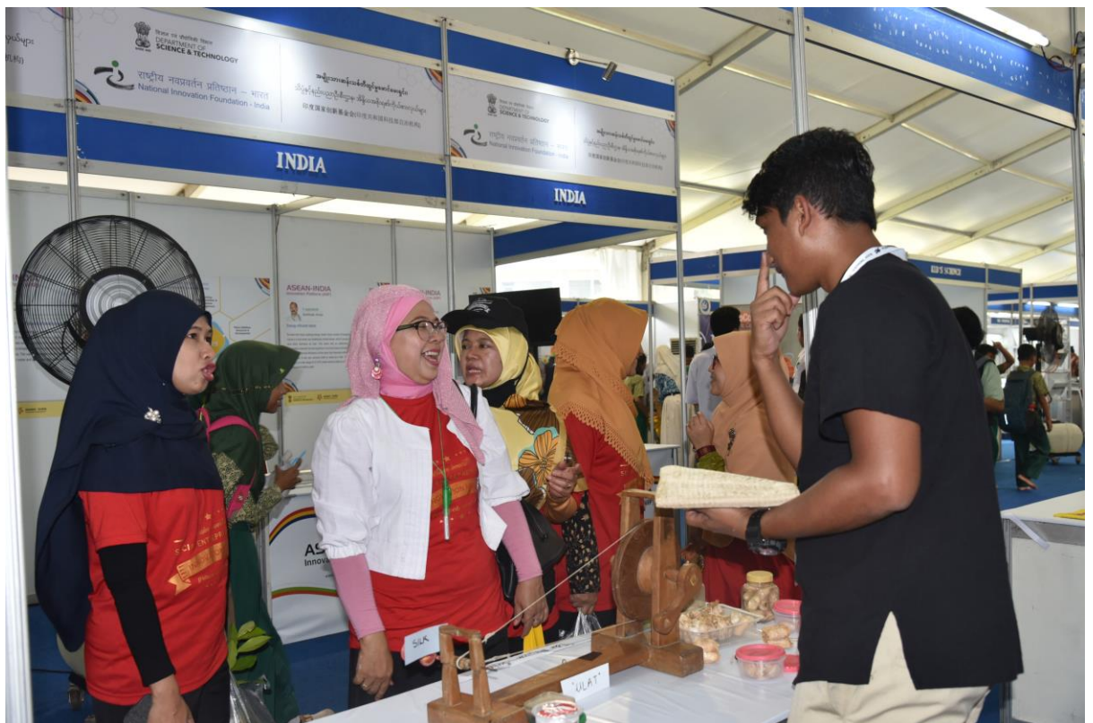
The Innovation Exhibition during ASEAN India Grassroots Innovation Forum