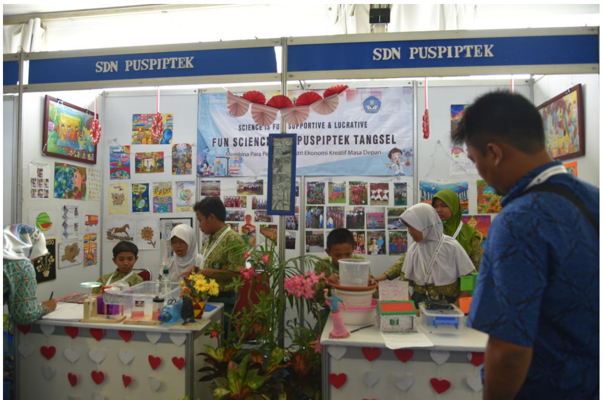
The Innovation Exhibition during ASEAN India Grassroots Innovation Forum