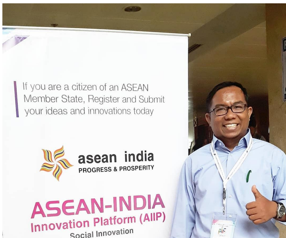
A delegate from ASEAN Member State at the ASEAN India Grassroots Innovation Forum 2018

ASEAN - India relations witnessed an important and unprecedented milestone this year when India's 69 th Republic Day celebrations was marked by the presence of leaders from all ten members of the Association of Southeast Asian Nations (ASEAN). It was preceded by the Delhi Declaration, which (among other things) agreed upon continued efforts towards deepening sectoral relations in science and technology (S&T) through cooperation on the ASEAN-India Innovation Platform, ASEAN-India Research & Training Fellowship Scheme, and ASEAN-India Collaborative Research and Development Programme, in areas aligned with ASEAN Plan of Action on Science, Technology and Innovation (APASTI) 2016-2025, including, among others, nano-technology, materials science and biotechnology; and enhance capacity building on S&T. 1 As a step in this direction to further consolidate S&T cooperation, ASEAN India Grassroots Forum was organized as a part of the Puspipitek Innovation Festival (PIF) - 2018 in Jakarta, Indonesia at the Center for Research Science and Technology, Indonesian National Science & Technology Park (PUSPIPTEK) Ministry of Research, Technology, and Higher Education between 27 th and 30 th September, 2018.