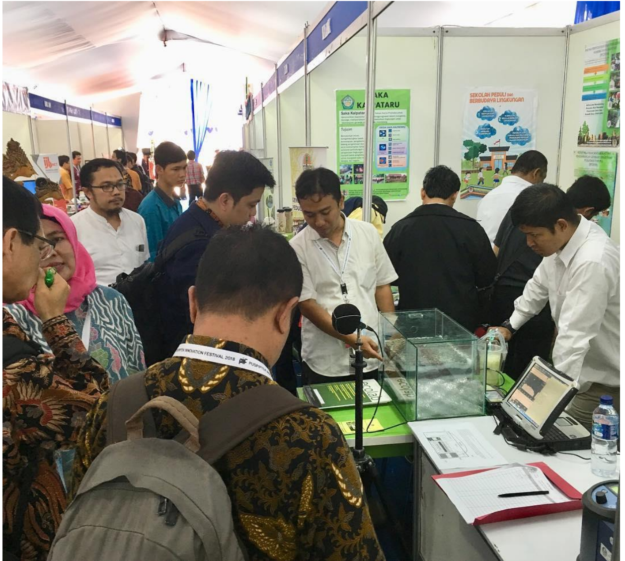
The Innovation Exhibition during ASEAN India Grassroots Innovation Forum