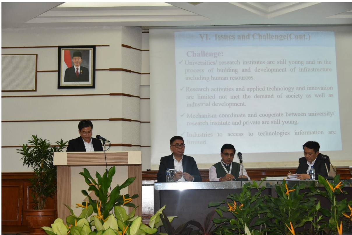
Panellists from India and ASEAN Member States during the Seminar