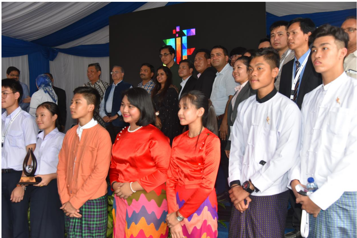
Group photograph of all participants in the ASEAN India Grassroots Innovation Forum at Valedictory function