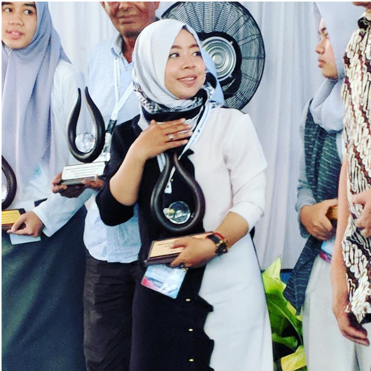
Competition Award winners along with their trophies during ASEAN India Grassroots Innovation Forum

experience some sort of mentorship by virtue of participating in seminar which comprised of couple of keynote addresses and panel discussions with participation from India, Cambodia, Indonesia, Laos, Philippines and Vietnam.