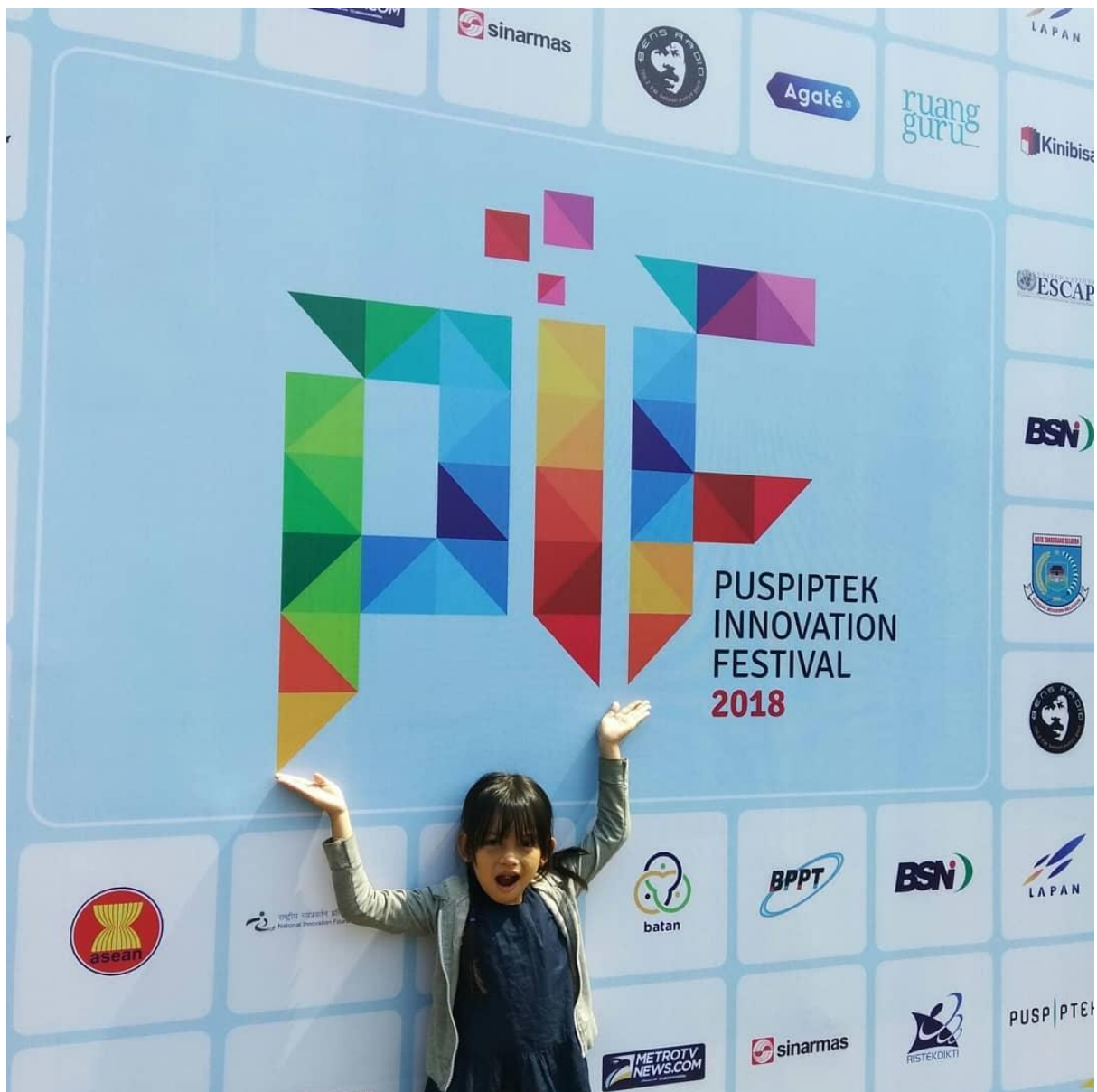
Children from ASEAN Member States attended Puspiptek Innovation Festival (PIF) – 2018, of which ASEAN India Grassroots Forum was an integral part