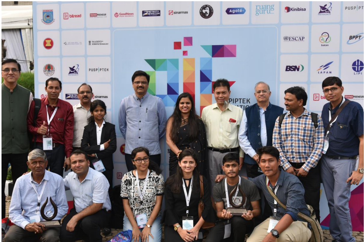
The Delegation from India along with the award winners and trophies won