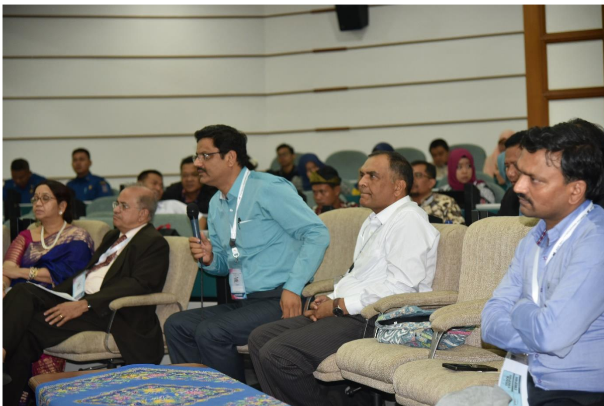
Q&A session following the Panel discussion

On Grassroots Innovation Ecosystem and Best practices of Grassroots Innovation, the common theme that emerged was that there is so much that countries may learn from each other as opposed to re-inventing the wheel. The lessons shared by National Innovation Foundation – India on how the public institution has provided hand holding and end to end incubation support to grassroots innovators and creative children in the country for nearly two decades, and more importantly this movement lead to job creation, entrepreneurship and formal entities as early as 2002 when terms like start-ups was Greek. However, lately innovation driven enterprises positioned themselves as start-ups.