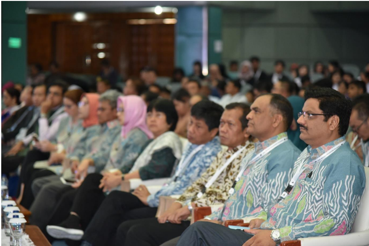
Delegates from India and ASEAN Member States on opening day of ASEAN India Grassroots Innovation Forum

During the four-day event, a series of activities were driven by National Innovation India – India (NII) and Department of Science and Technology (DST), Government of India and all of them in some way or the other deepened the Science, Technology and Innovation relationship between India and ASEAN Member States. The curiosity to know more about each other's innovations during competition, the thoughts that stemmed from either the speakers from either nation or audience from another nation during seminar (keynote address and panel discussions) and the profound inquisitiveness demonstrated by visitors at the Innovation exhibition was a major highlight, which would constantly remind us about the strong and meaningful ASEAN - India Dialogue Relations under the theme of "Shared Values, Common Destiny".