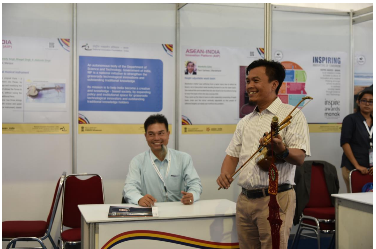
The Innovation Exhibition during ASEAN India Grassroots Innovation Forum