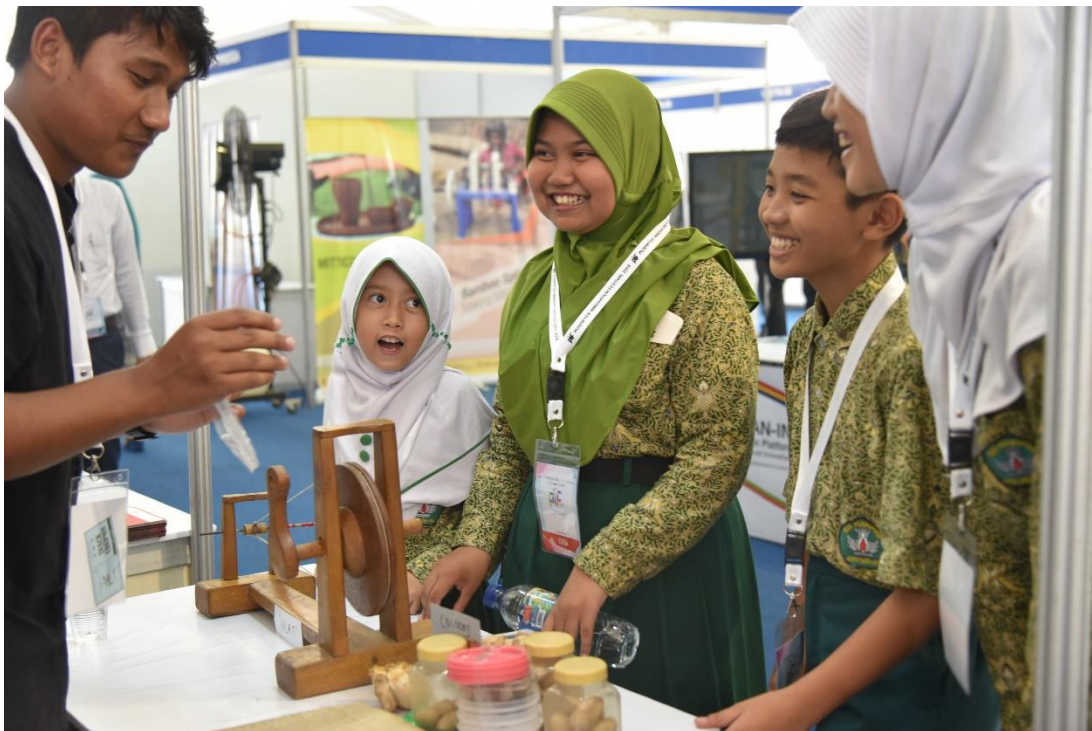
The Innovation Exhibition during ASEAN India Grassroots Innovation Forum